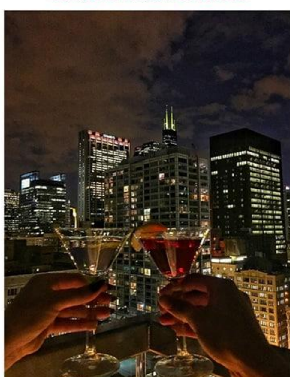
[A60 Photo: Juliana Shallicross; All others courtesy of the hotels mentioned]